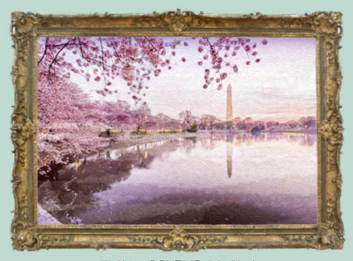
Washington, D.C.'s Tidal Basin in all its glory.

This year, the weather in Washington, D.C. has been rather muddled. We have had gloriously warm days followed by blistering cold snow. Unfornately, the city's beautiful and historic Cherry Blossoms which frame the Tidal Basin and attract thousands of tourist, have not blossomed as they should have and tourist are seeing mostly pale pink Cherry Blossoms. However, this has not stopped Washingtonians from celebrating the Cherry Blossom festival. This year, the Opening Ceremony was held at the Warner Theatre with performances from the U.S. and Japan. Th next event held was the Blossom Kite Festival located on the grounds of the Washington Monument. The kite festival is known for it's variety of events including the Rokkaku Battles and the Hot Tricks Showdown. Many kite makers and kite enthusists come from around the world to showcase their kites and their talents. During this event, you can see everyone from a Rokkaku expert to a child with his homemade kite. And as its final and greatest event, Washington, D.C. saw the National Cherry Blossom Festival Parade whose route went down Constitution Avenue from 7th Street to 17th Street. Marching in the festival were themed floats, giant character helium balloons, marching bands, community groups, dancing performers, and celebrity entertainers. This is truly one of the best parades that Washington, D.C. has to offer.